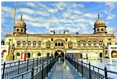
The Gurdwara Janam Asthan in Nankana Sahib, Pakistan , commemorates the site where Nanak is believed to have been born.

Nanak was born on 15 April 1469 at Rāi Bhoi Kī Talvaṇḍī village (present-day Nankana Sahib, Punjab, Pakistan ) in the Lahore province of the Delhi Sultanate , [6][7] although according to one tradition, he was born in the Indian month of Kārtik or November, known as Kattak in Punjabi. [8]