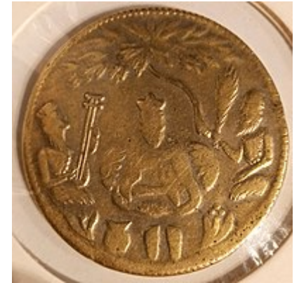
Coin from 1747 CE depicting Guru Nanak with his two disciples, Bhai Mardana and Bhai Bala waving a chaur (fly-whisk) as a mark of respect.

Nanak's teachings can be found in the Sikh scripture Guru Granth Sahib , as a collection of verses recorded in Gurmukhi .