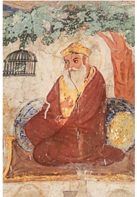
19th-century mural painting from Gurdwara Baba Atal depicting Nanak