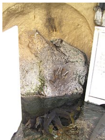
Guru Nanak's handprint is believed to be preserved on a boulder at the Gurdwara Panja Sahib in Hasan Abdal , Pakistan .