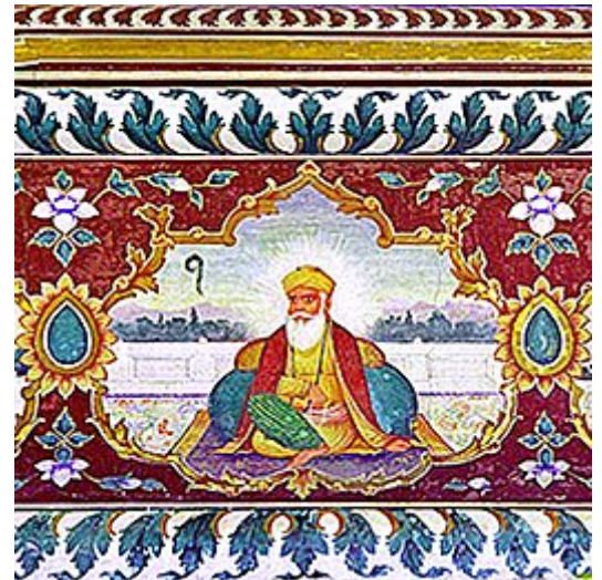
Fresco of Guru Nanak

Sikhism does not subscribe to the theory of incarnation or the concept of prophet hood . But it has a pivotal concept of Guru . He is not an incarnation of God, not even a prophet. He is an illumined soul.