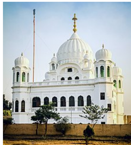
Gurdwara Darbar Sahib Kartar Pur in Narowal, Pakistan marks the site where Guru Nanak is said to have died. [24]