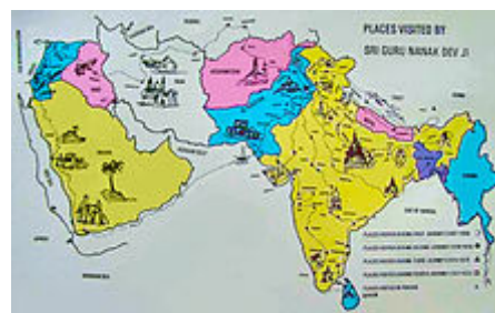
The 4 Udasis and other locations visited by Guru Nanak