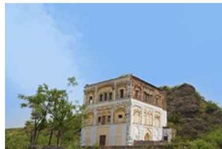
The abandoned Gurudwara Chowah Sahib , located near the Rohtas Fort in Pakistan , commemorates the site where Guru Nanak is popularly believed to have created a water-spring during one of his udasis . [31]

One popular janamsakhi was allegedly written by a close companion of the Guru, Bhai Bala . However, the writing style and language employed have left scholars, such as Max Arthur Macauliffe , certain that they were composed after his death. [21] According to such scholars, there are good reasons to doubt the claim that the author was a close companion of Guru Nanak and accompanied him on many of his travels.